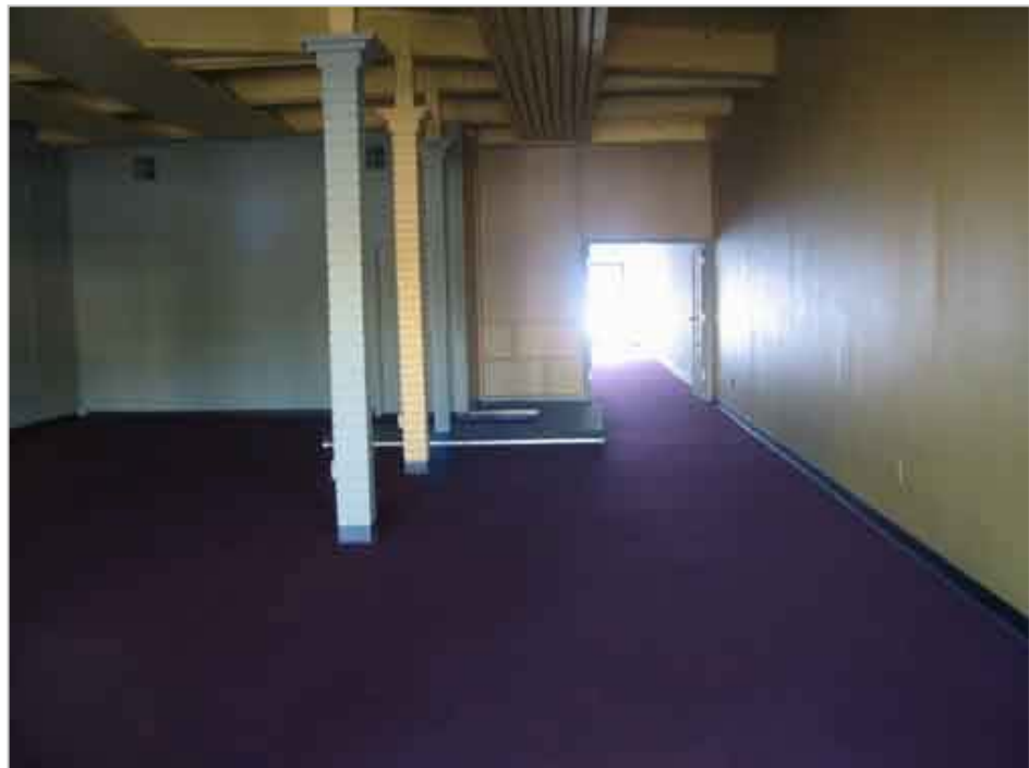
# 1519 Interior →

..... GORDON COMMERCIAL REAL ESTATE SERVICES