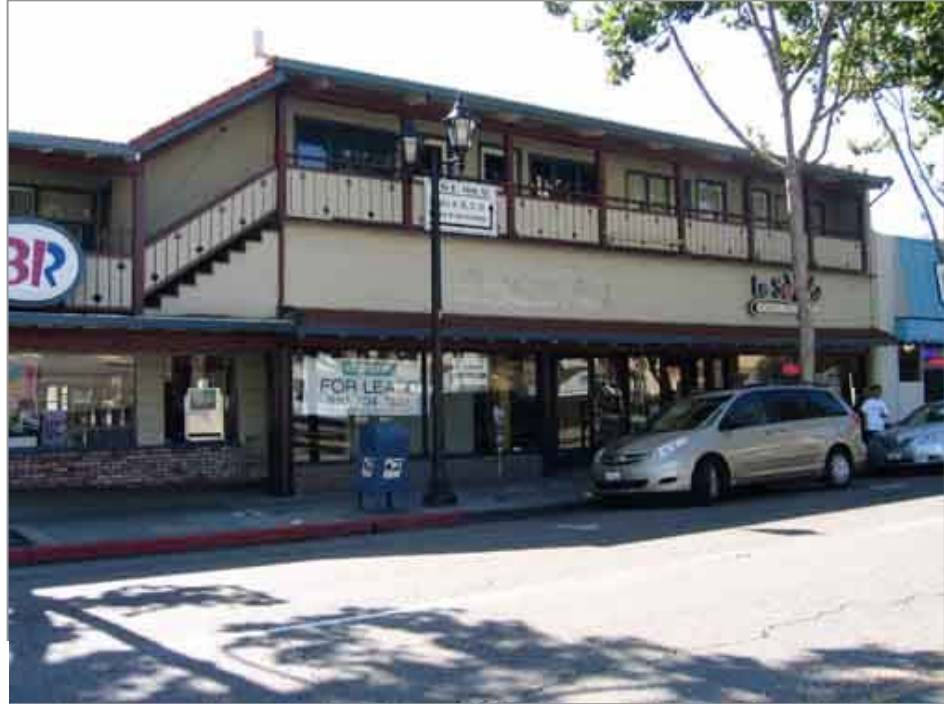
1519 E 14 th St. →